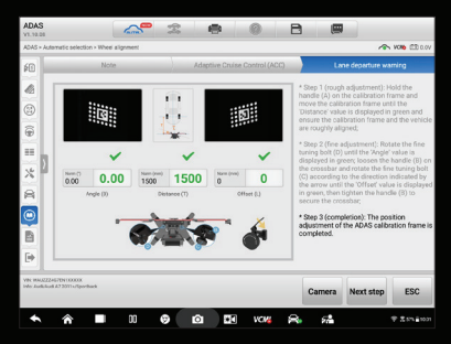
The industry's fastest and most accurate frame placement in as little as a minute.