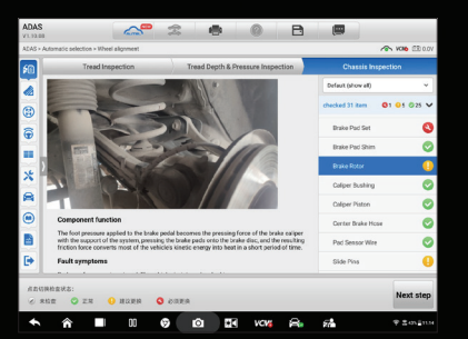
Vehicle inspection of tires, brakes, suspension, steering, and more. Mark service recommendations, attach photos and notes.