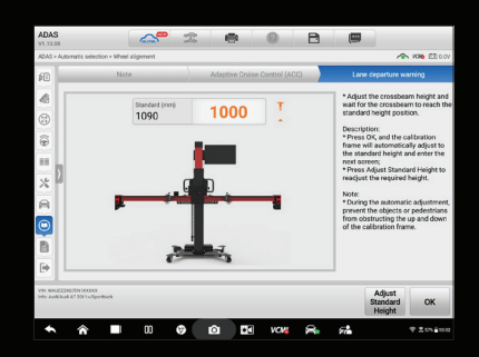
Set ADAS calibration target height with the push of a button.